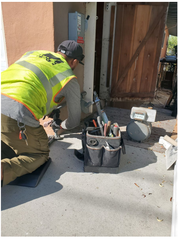
Removing natural gas meter, August 2022.