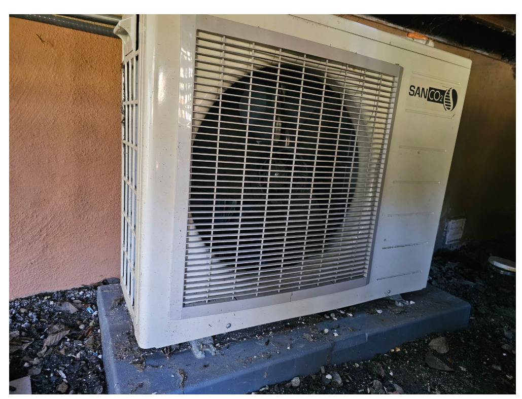
Heat pump for heating water, placed under deck (water tank in house where gas water heart was removed).