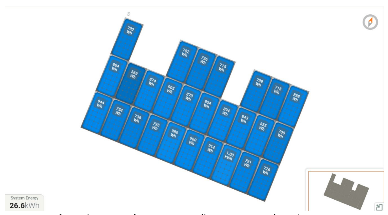
Rooftop solar array w/ microinverters (battery in garage), Enphase system