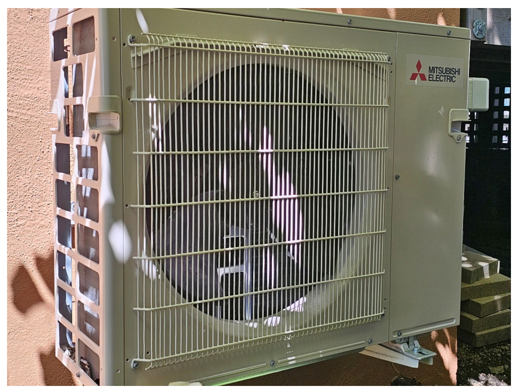
Heat pump for heating & cooling air, attached to side of house.